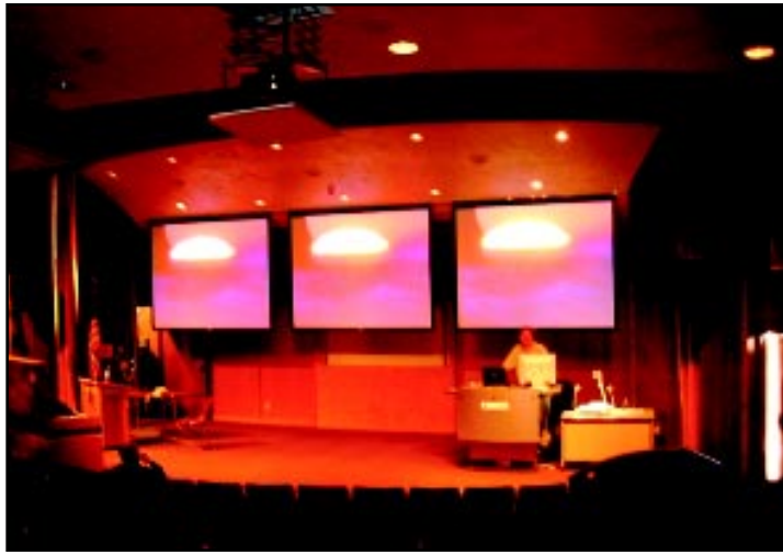
Salt Lake Community College's auditorium-style room.