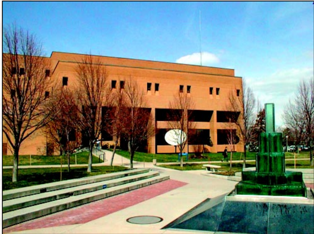
The Salt Lake Community College Technology Building, which houses the SuperTeaching classroom.

Used at Salt Lake Community College and Emmons Lake Elementary School, the system captures students' attention and reinforces learning.