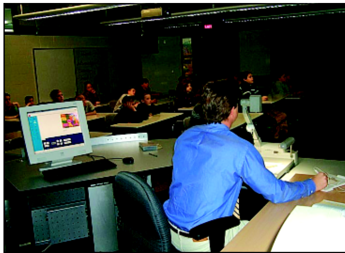
A "teaching" station at Emmons Lake Elementary School.

Uminn noted that the Salt Lake Community College site wanted to be able to do special events on the lecture hall stage. "In order to make everything as removable as possible and have minimal wiring, one of the things we did was transmit the VGA and