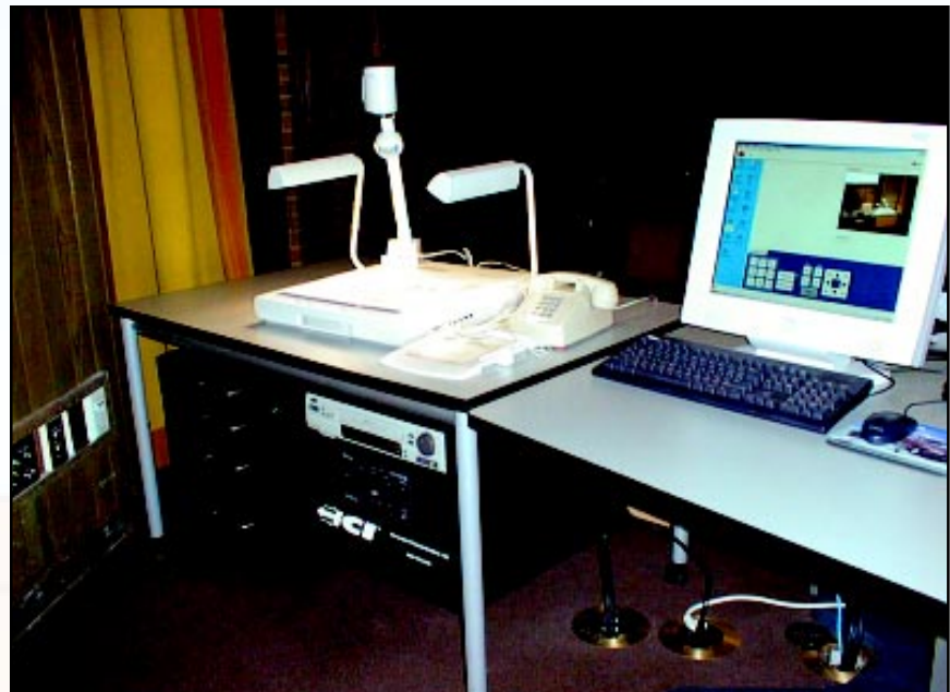
A touchscreen on the teacher's desk controls all system features with less than a dozen picture icons.

"It certainly seems to us to have potential. We did a lot of testing this year to give us our baseline data. Then after we have an opportunity to get trained and fully utilize the room and the equipment, we'll be better able to talk about whether or not it's doing what we hope it will do."